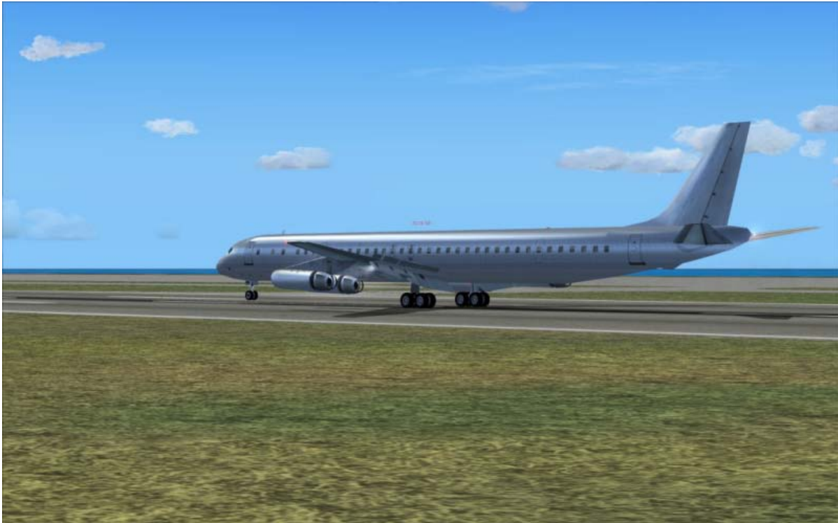
Reversers in action on a prototype model during development.

The flight model is set to give her the correct take-off run in North America and Europe.