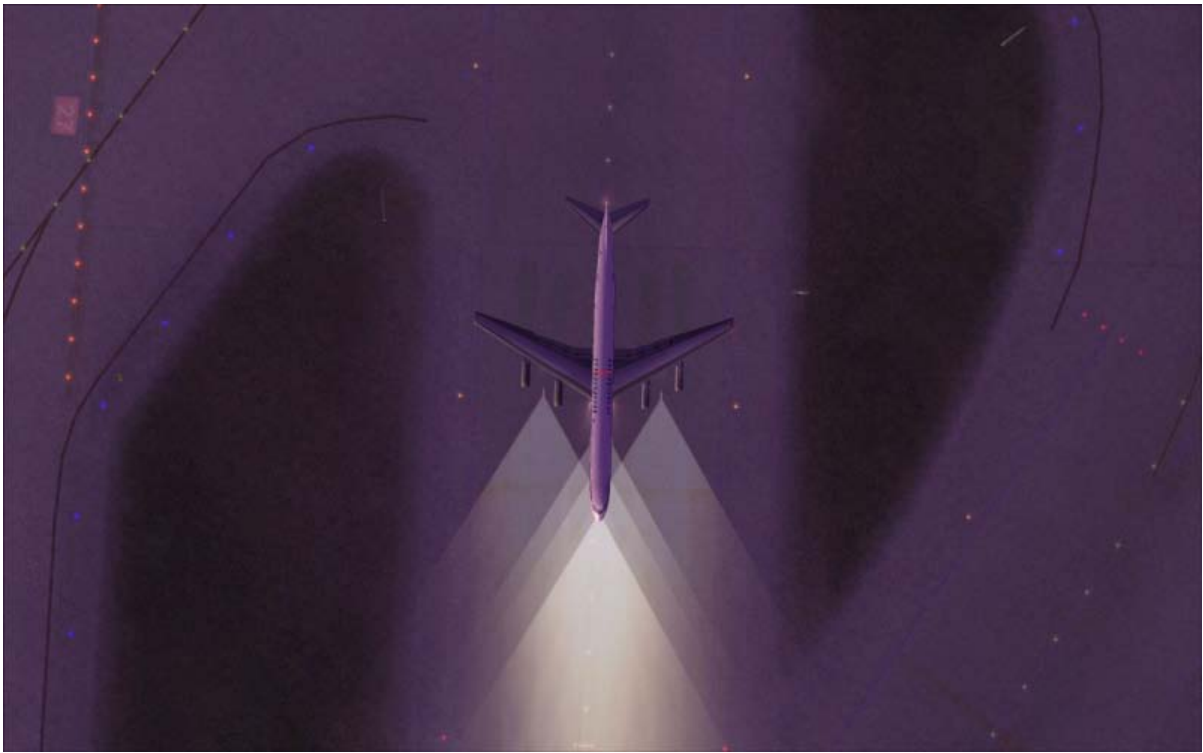
Shockwave Lights illuminating the runway for takeoff.