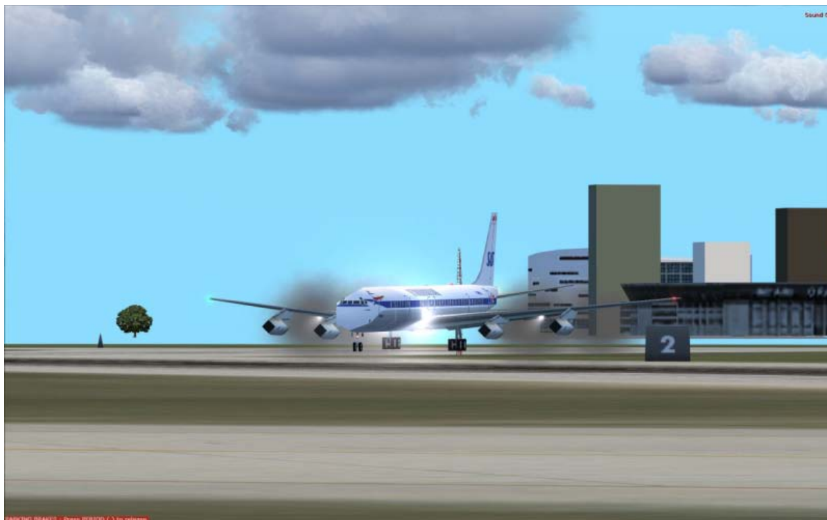
LOD 7 in all its glory.

There are two aircraft.cfg files supplied.