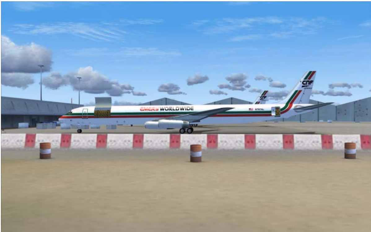
DC-8-63F showing opening main cargo deck door and service door

The main difference is that the dedicated freighter does not have an opening main entry door, but an opening main deck cargo door.