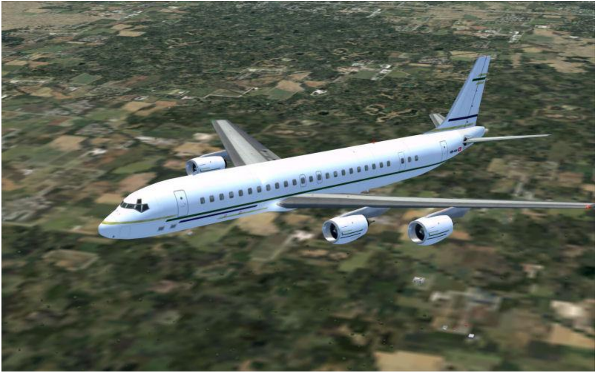
DC-8-72 passenger aircraft

Thank your downloading the Historic Jetliners Group's AI model of the Douglas DC-8-72.