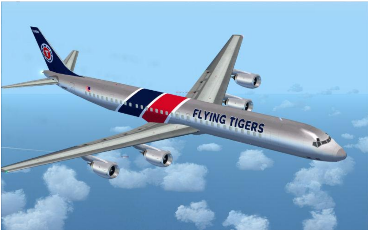
Flying Tigers DC-8-73F