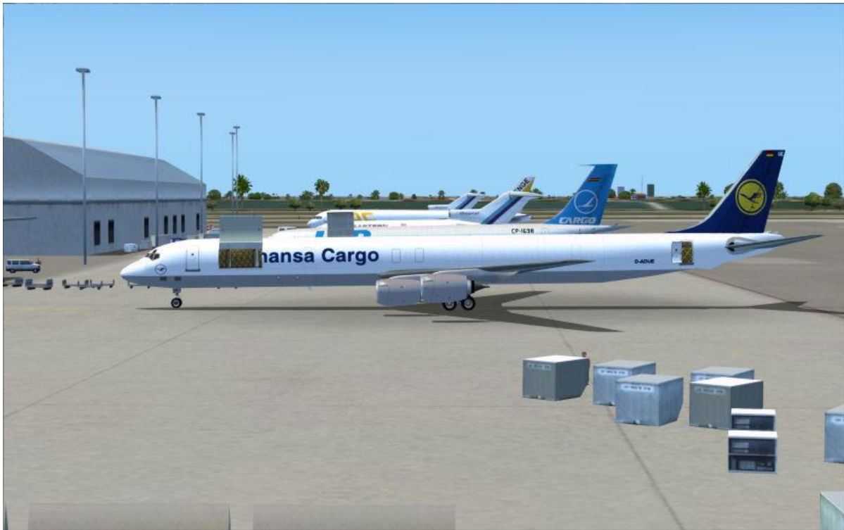
DC-8-73F showing opening main cargo deck door and service door

The doors are controlled by XML, which also controllers the flaps for takeoff and landing. The thrust reversers are fully modelled with sliding cowls and working clam shell doors. The fuselage , engines and some other areas have the shine built into the model material, so as to avoid those over bright colours and totally over the top shiny engines that some people seem to produce. The picture above is in full sun, and you can see the shine on the top of the fuselage and engine nacelles.