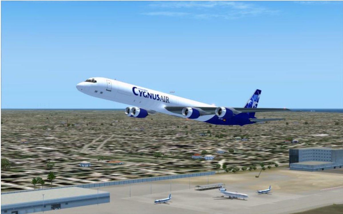
Cygnus Air DC-8-73CF